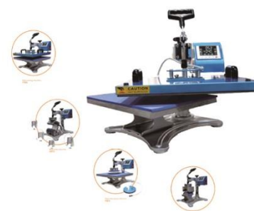
Star Luxury Combo 8-in-1(3343)