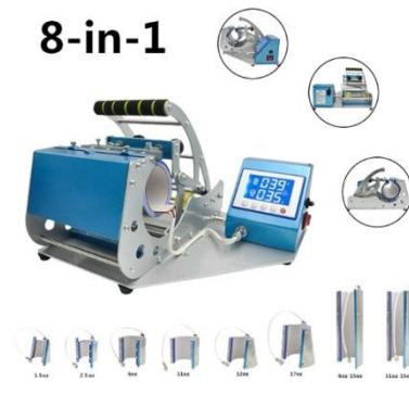
Star Magnetic Mug 8-in-1