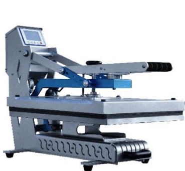
Star Auto Clam - AS