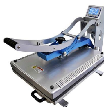
Star Auto Clam - CS