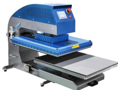
Star Air Fusion - P