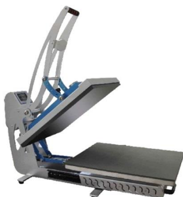
Star Auto Clam - BS