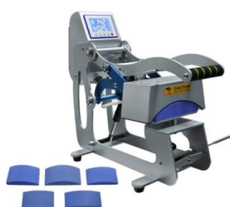
Star Cap Press