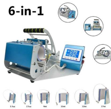
Star Magnetic Mug 6-in-1