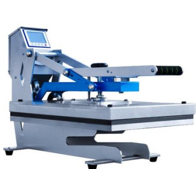
Star Auto Clam - A