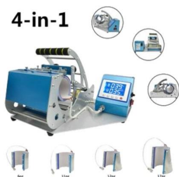
Star Magnetic Mug 4-in-1