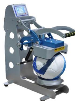
Star Ball Press