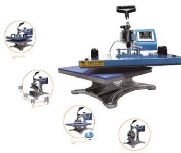
Star Luxury Combo 8-in-1(3838)