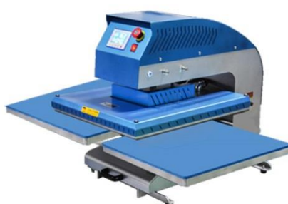
Star Air Fusion Dual - DP