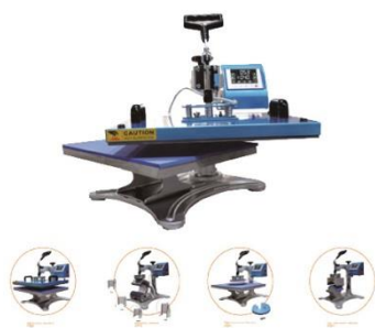
Star Luxury Combo 8-in-1(2938)