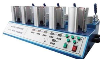
Star Multi Mug Press 5-in-1