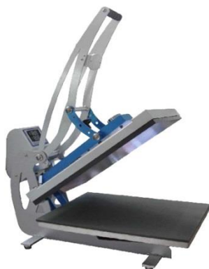
Star Auto Clam - B