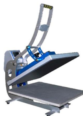
Star Auto Clam - C