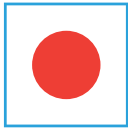
Made in Japan