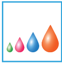
Piezo Variable Drop