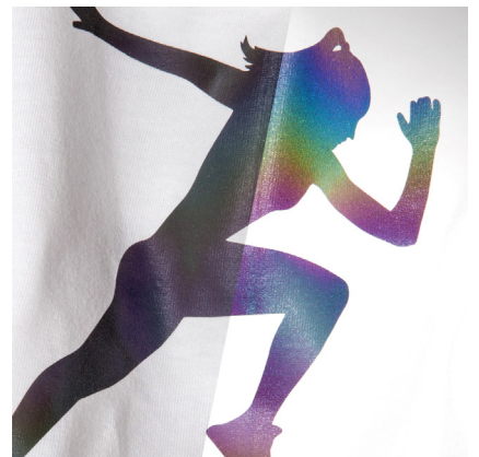
BF REF777A - REFLECTIVE RAINBOW THE DARK COLOR REFLECTS AS RAINBOW