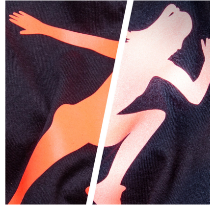
BF REF730A - REFLECTIVE NEON RED THE NEON RED COLOR REFLECTS AS RED