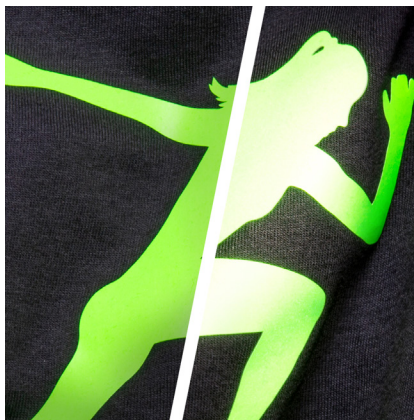
BF REF750A - REFLECTIVE NEON GREEN THE NEON GREEN COLOR REFLECTS AS GREEN