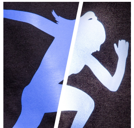
BF REF740A - REFLECTIVE ROYAL BLUE THE ROYAL BLUE COLOR REFLECTS AS BLUE