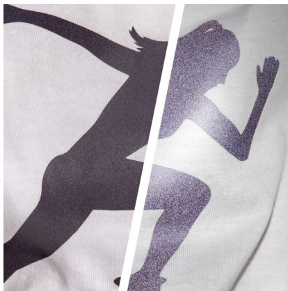
BF REF710A - REFLECTIVE BLACK THE BLACK COLOR REFLECTS AS BLACK