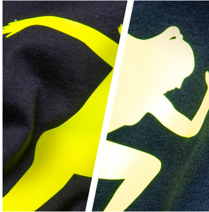
BF REF720A - REFLECTIVE NEON YELLOW THE NEON YELLOW COLOR REFLECTS AS YELLOW