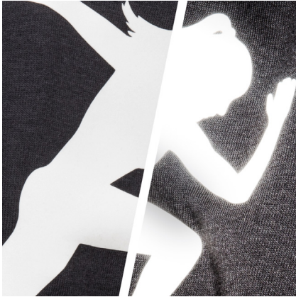
BF REF700A - REFLECTIVE WHITE THE WHITE COLOR REFLECTS AS OPTICAL WHITE